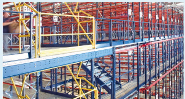
The old, traditionally constructed archive